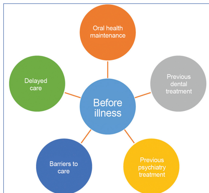
[Table/Fig-1]: Thematic diagram before illness.